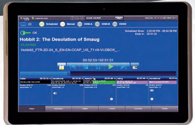
(Multi-platform Screen Management System)