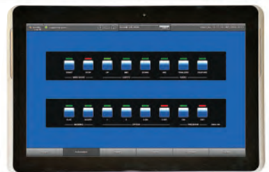
Automation Screen on SMS